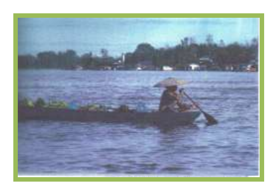
The Mahakam River in Kalimantan, Indonesia